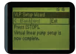
STEP 5: Complete VLP Setup