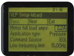
STEP 1: Input Motor's Electrical Specifications

Toshiba stands at the forefront of innovation with our remarkably intuitive and user-friendly startup. In fact, out-the-box, the Q9 Plus is only minutes from complete configuration and full optimization of your HVAC system's performance.