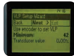
STEP 4: Input VLP Minimum