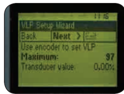
STEP 3: Input VLP Maximum