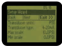
STEP 2: Input Transducer Specifications